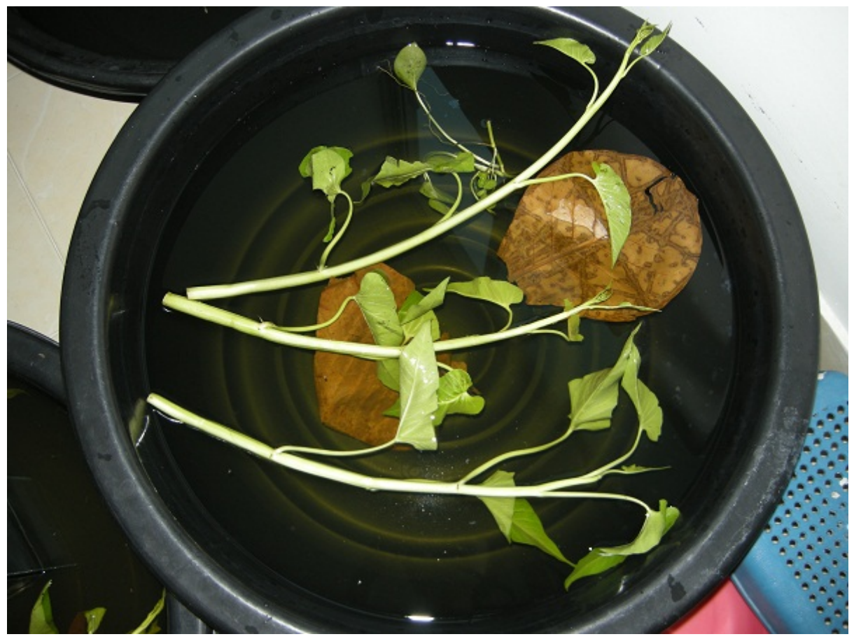
2. Put the male & the female's tank into this spawn tank. Let them look at one another. Give them food 2 times daily.

1.I use tap water for breeding betta fish...add tap water into spawn tank about 4-5 inch height. Add a little salt and put 2-3 Indian Almond leaves into the tank. Put aquarium plants that you can find at your home. See the picture.